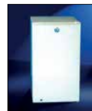
Refrigerator 48 x 53 x 82 cm