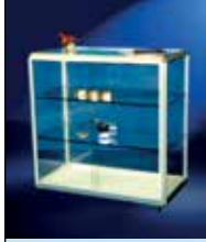
Low Showcase 100 x 50 x 100 cm