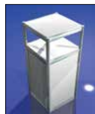
TV Stand 50 x 50 x 120