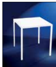
Square Table White - 70 x 70