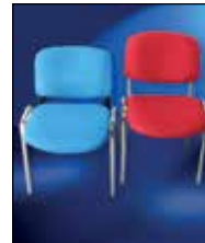
Upholstered Chair Blue / Red