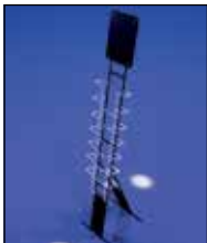
Brochure Rack Free Standing