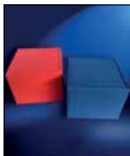
Coffee Table 50 x 50 x 45 cm