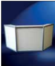
Information Counter 200 x 50 x 100 cm