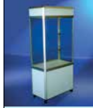
Tall Showcase 85 x 45 x 190 cm