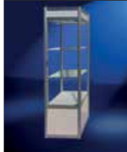
Octanorm Tall Showcase 50 x 50 x 200 cm