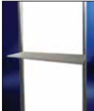
Flat Shelf 100 x 30 cm