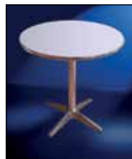
Round Table Chrome