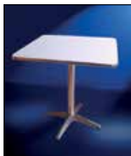
Square Table Chrome - 70 x 70