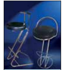
High Stool Chrome