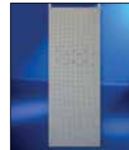
Big Pegboard 90 x 240 cm