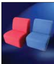
Sofa Seat Red / Blue