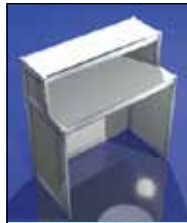
Reception Counter 100 x 50 x 105 cm