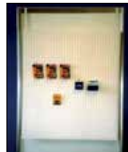
Small Pegboard 90 x 120 cm