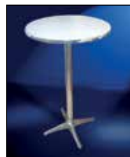
Bar Table D=60, H=120 cm