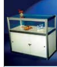
Octanorme Showcase 100 x 50 x 90 cm