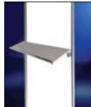
Slope Shelf 100 x 30 cm