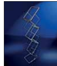
Brochure Holder Zig Zag