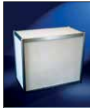
Lockable Counter 100 x 50 x 90 cm