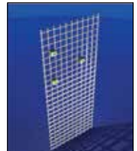
Grid Panel 90 x 180 cm