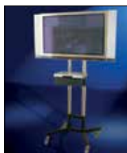
LED TV Screen 42" & 32"