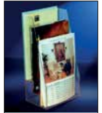
Brochure Holder Table Top