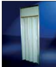
Folding Door 200 x 100 cm