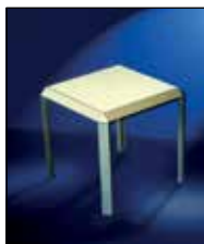
Coffee Table 50 x 50 x 45 cm