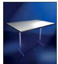
Large Table 120 x 70 x 75 cm