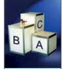
Exhibit Base H=50 x 50 x 50 cm H=50 x 50 x 75 cm H=50 x 50 x 100 cm